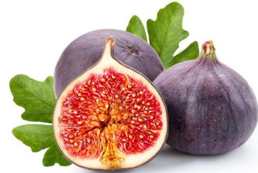
FIG Ficus carica

The raw, dried fig is very nutritious and is a rich source of dietary fibre, potassium, protein, minerals (iron, phosphorus, magnesium, copper) and vitamins (B2 and B6).